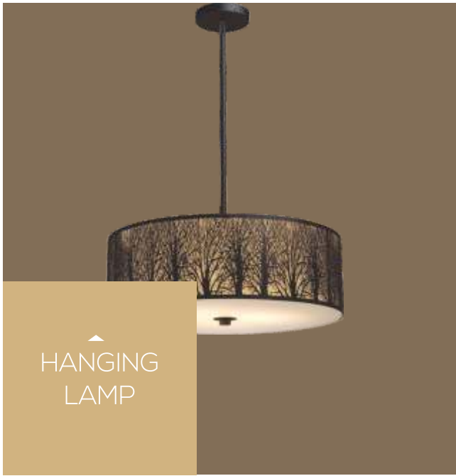
▲ HANGING LAMP