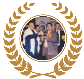
TOP EXPORT AWARD (ART METAL)