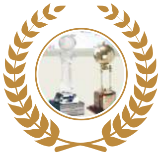
OUTSTANDING NATIONAL EXPORT PERFORMANCE (ALUMINUM ART WARE)