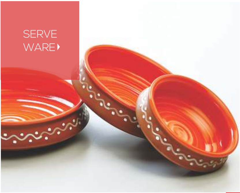
SERVE WARE ▶