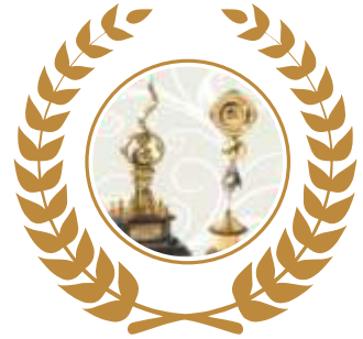
EXCELLENT EXPORT GROWTH AWARD (IRON),