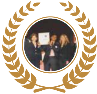
TOP EXPORT AWARD (HANDICRAFTS),